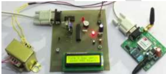
Fig.4.1. Hardware kit.

We have used various components in the IOT and Arduino based FIRE AND GAS leakage detection system. FIRE AND GAS Gas Sensor is used to detect the gas leakage. Arduino is used to turning ON the buzzer, to send a message to LCD and to send data to the IOT module. LCD is used to display an informative message. A buzzer is used to signal the gas leakage. And ESP8266 is used to send data over a Wi-Fi network.