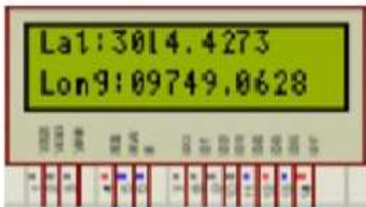
Fig.4.3. Output in LCD

IoT module will track the current location of the victim and it will update the location on the webpage. The microcontroller will switch ON the buzzer in the device, so that nearby people may come to know that someone is in danger and they will come to rescue.