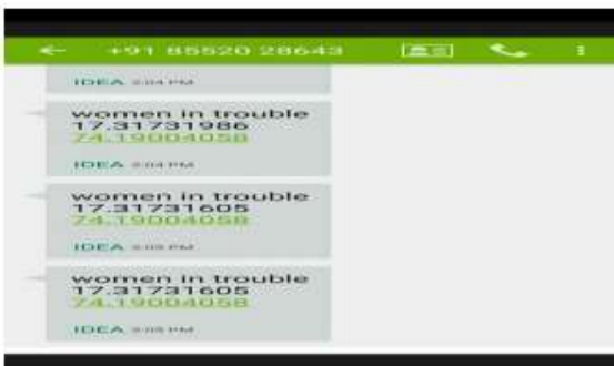
Fig.4.2. Output results.

IoT module will track the current location of the victim and it will update the location on the webpage. The microcontroller will switch ON the buzzer in the device, so that nearby people may come to know that someone is in danger and they will come to rescue.