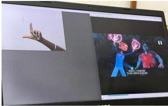
Figure 3 Pause

In Figure 3 by recognizing our hand gesture the pause operation is done by repeating the same we can resume that process when this specific hand gesture is recognized