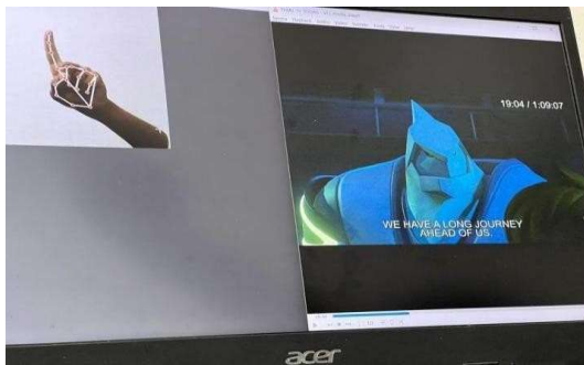
Figure 4 Previous

In Figure 3 by recognizing our hand gesture the pause operation is done by repeating the same we can resume that process when this specific hand gesture is recognized