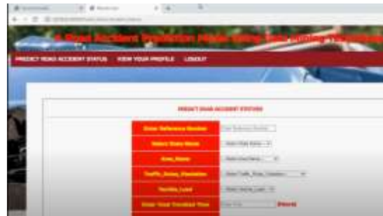
Fig.4. Prediction of dataset.