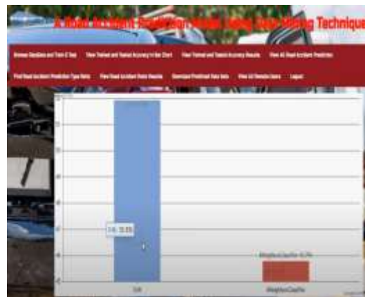
Fig.8. Accuracy of output.