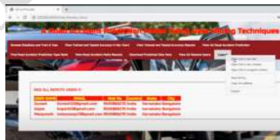
Fig.2. Login details.