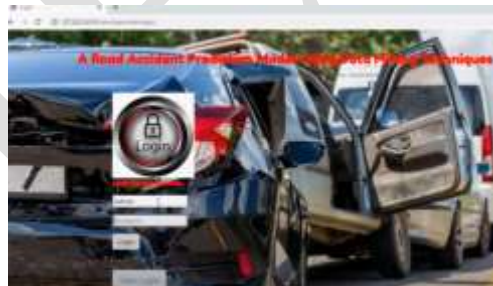
Fig.1. Home page.

Raw datasets were terribly filthy, not in a format that computer machines could understand, and provided partial data to use as is. The effectiveness of the crash severity prediction model will be reduced if such datasets are used. As a result, irrelevant datasets should be eliminated in order to generate maximum data. Before designing the model, the researchers was using an expensive data preparation technique to obtain relevant and determinant potential risks, such as cleaning the data, missing value handling, outlier management, dealing with absolute value encoding, and standardization.