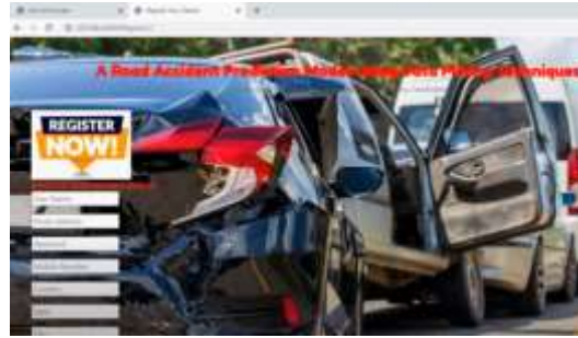
Fig.3. Registration page.