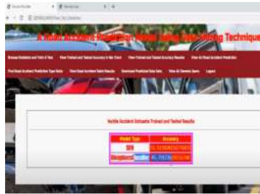
Fig.7. SVM accuracy.